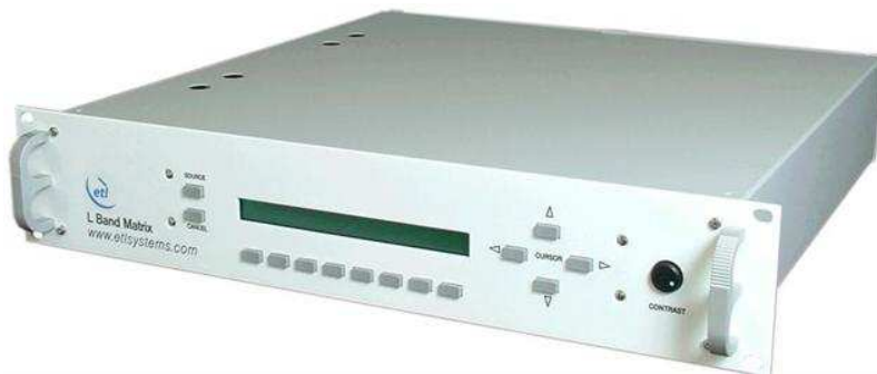
Front View of similar Model M0808D2UFL-B7B7-A

With Local & Remote Control (via RJ45 Ethernet Port and RS232/422/485 Serial Port)