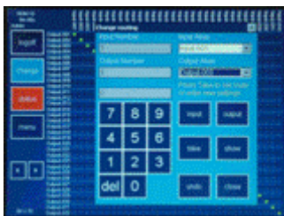
Fig 4 – Routing screen

On board log records all routing changes for each user