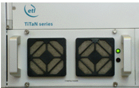
Fig 10 – Hot-swap power supplies