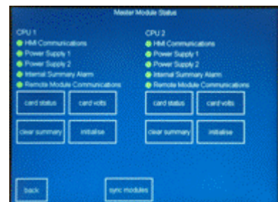
Fig 11 – Touchscreen Monitoring Page

The matrix continuously monitors the conditions of amplifiers, CPUs and PSUs. Any faults are immediately reported through the front panel and remotely. Alarms report the specific faults down to component level.