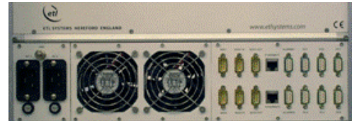
Fig 3 – Expansion & Control Ports

Control & Expansion - Monitoring & Control is via RS232 / 485 or RJ45 ethernet. Serial ports on the rear allow future expansion.