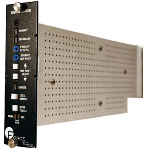
Model 3020 RF Switch